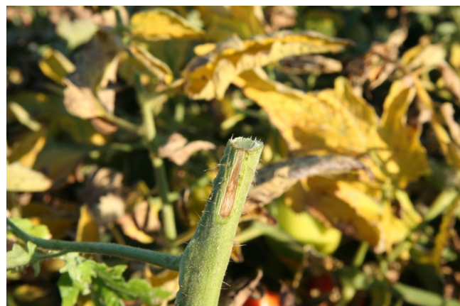
Fig 1 & 2. Fusarium wilt with typical yellowing of branches and leaves (left-side photo). Lower stem cut crosswise and exposed to show dark vascular discoloration (right-side photo).